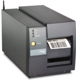
A label printer

RadioWorks includes native support for Intermec label printers and ships with a variety of label formats for receiving and bin labels. You can format your own labels with different fields or different sizes by starting with a given format and modifying it to your needs. "Native support" means that printing is made very fast by bypassing the usual Windows printer queues. Printing is done directly off the handhelds—a quantity of receiving labels, for example, is entered as a receipt is entered.