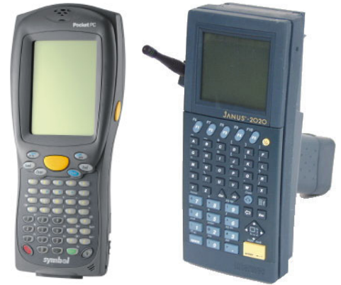
A Symbol PocketPC computer and an Intermec MS-DOS computer that both run RadioWorks. Both have full keypads and built-in laser scanners.

We also recommend that customers choose handhelds with a full alphanumeric keypad. The repeated inconvenience of fumbling with handwriting recognition or graphical keypads discourages use of the devices, and in the long term offers no savings in time or money.